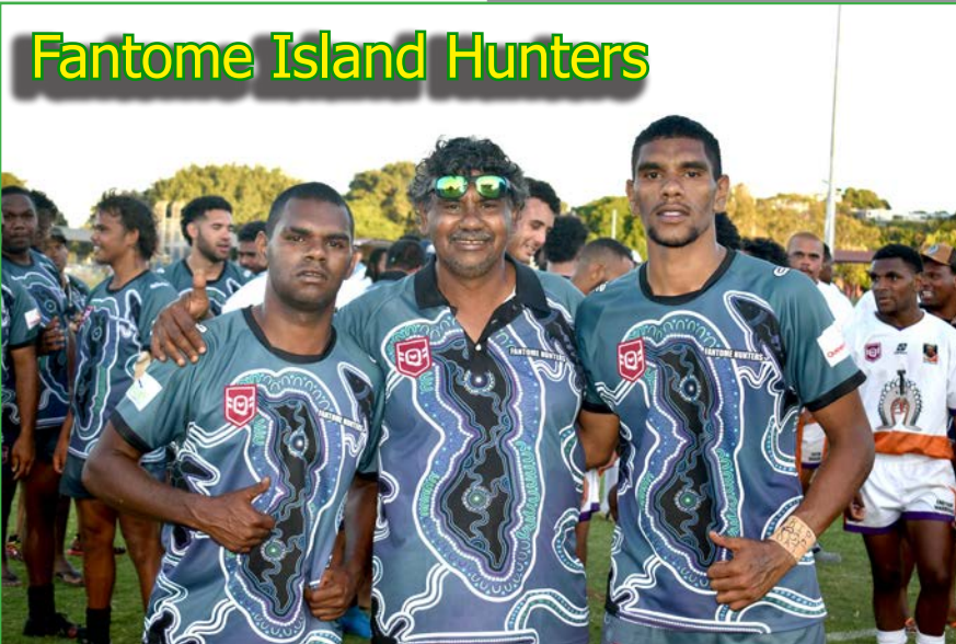
Fantome Island Hunters