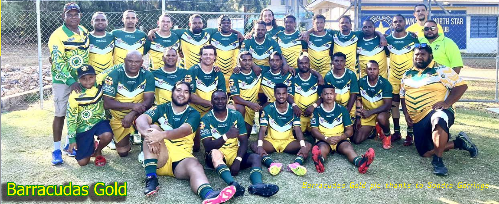
Barracudas Gold