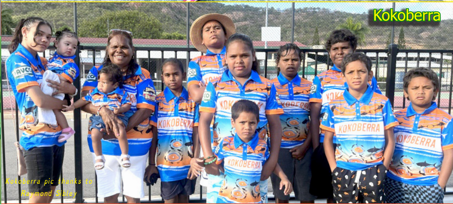
Kokoberra