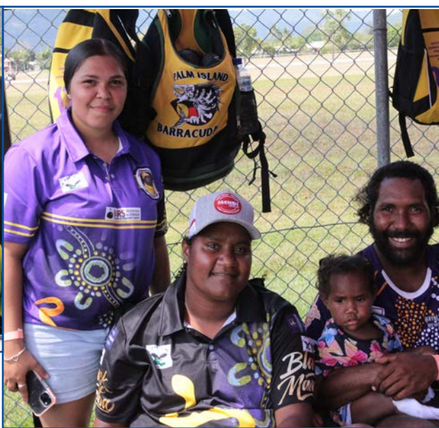
Also in Gordonvale last weeknd.